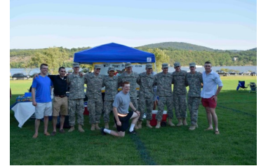
CADETS FROM MA AND THEIR GUESTS POSE FOR A PHOTO AT THE 2015 WPPC-MA POST-GAME TAILGATE AT SOUTH DOCK AFTER FEASTING ON AMERICAN BURRITO'S DELICIOUS MEXICAN FARE AND HOMEMADE TREATS DONATED BY MASSACHUSETTS FAMILIES

For now, mark September 10th on your calendar and start inviting family and friends to this unique college football experience.