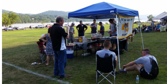
MORE THAN 20 CADETS AND SEVERAL MASSACHUSETTS FAMILIES COOLED OFF AT SOUTH DOCK TO WRAP UP AN EXCITING OPENING DAY

solidified but mark your 2015 calendar now. This weekend is being considered for Parents' Weekend so be sure to secure accommodations early.